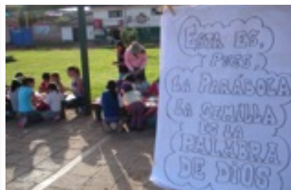
Planting the Word at Bible club.