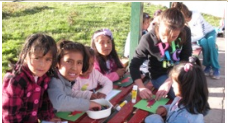
A few girls during Bible club.

Sunday service is at 10 a.m. We have invited the neighborhood by knocking on doors and passing out fliers and over the past few months we have seen several visitors, but nothing consistent. We are confident that we are where the Lord would have us and are doing what He has called us to, now we are exploring other ways to get people through the door. Later on in the afternoons we visit Azul Wasi, an orphanage just outside the city, and bring church to them as it is hard for 15 boys to be transported.