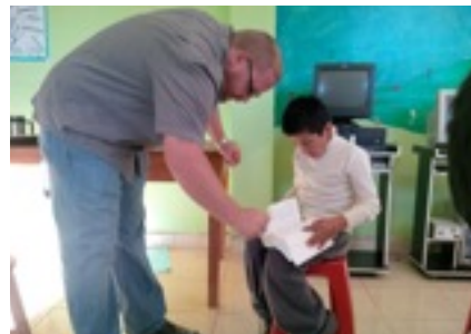
Preparing to teach at Azul Wasi.