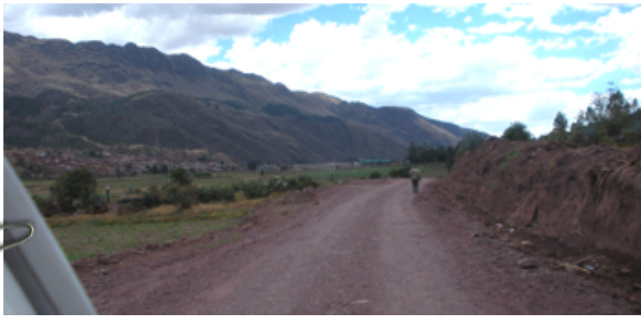
On a road just outside of the city.